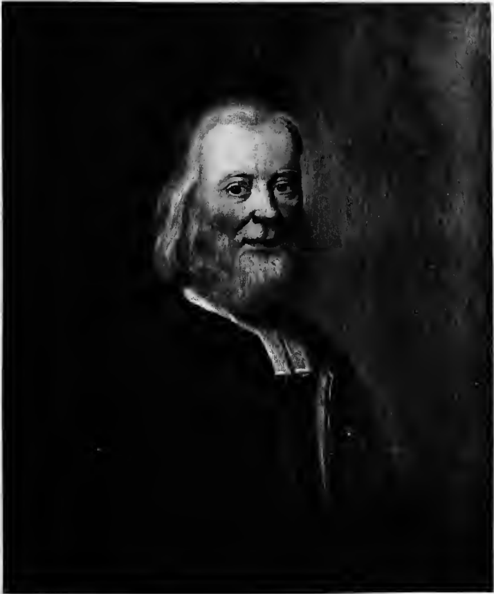
WALTER SCOTT SIR WALTER'S GREAT GRANDFATHER. FROM THE PICTURE AT ABBOTSFORD.